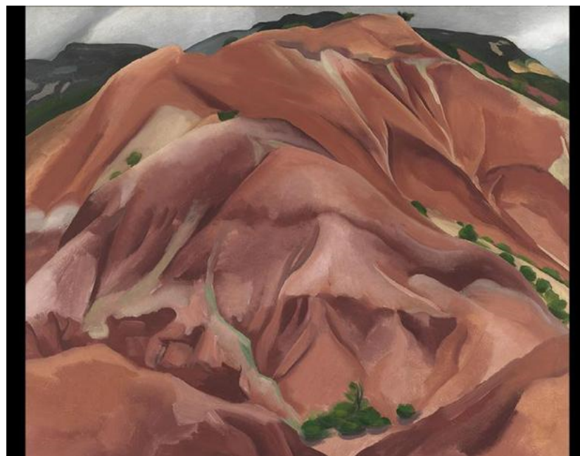
Art Inspiration May 23rd, 10-11:30 a.m $75