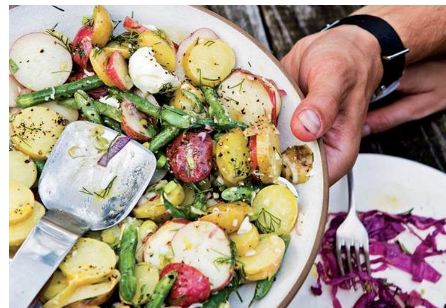
Memorial Day Classics May 14th, 12-2 p.m $65