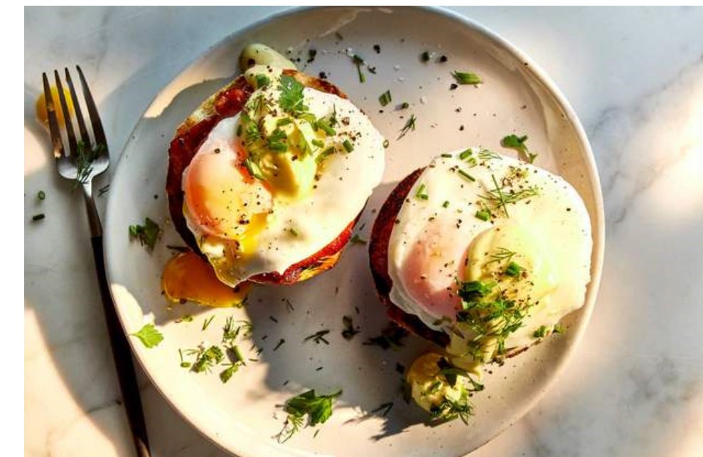
Sous Vide Brunch May 19th, 12-2 p.m $65