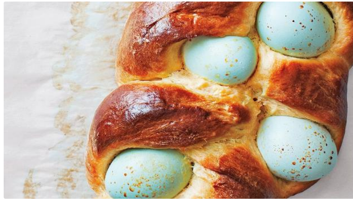
Easter Breads April 11th , 12-2 p.m $65