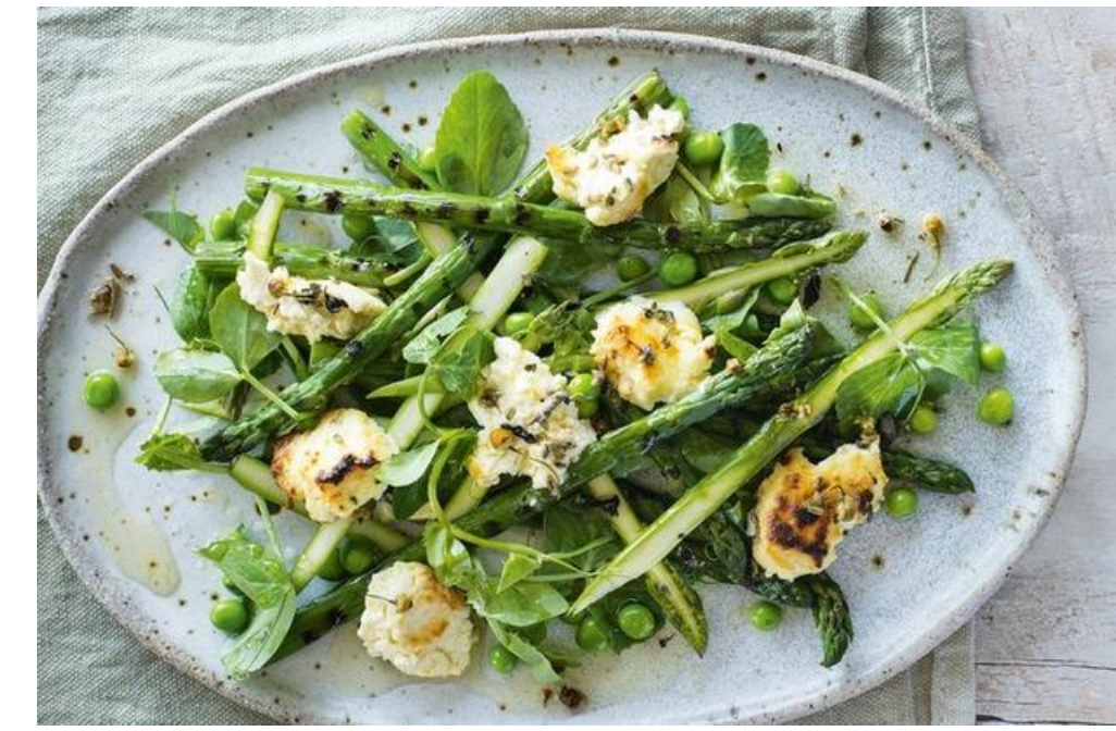
Spring Salads April 23rd, 12-2 p.m $65